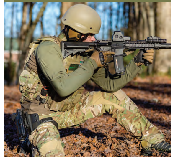
Flex9Armor™ Shirt - Shown above in Ranger Green and MultiCam pattern shown on the left.